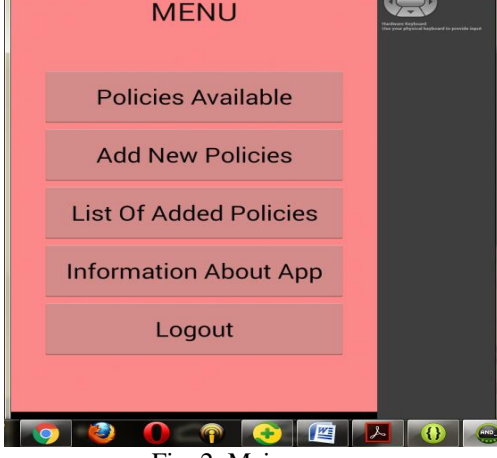
Fig. 2: Main menu

In that window provide the four tab. In first that show the available policy that can be apply by user also if the user wants to create new policy as their requirement using second tab that is add new policy. Using the third tab user can check under which policy which of the restriction is applicable. That is only provide the information not any of modification is made in that tab. In forth of the tab its provide the information regarding the application. And last tab is for the log out form the application.